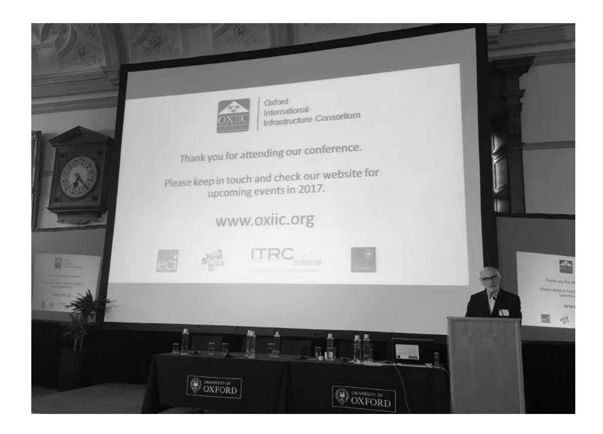
Speaker for Concluding Keynote Speech