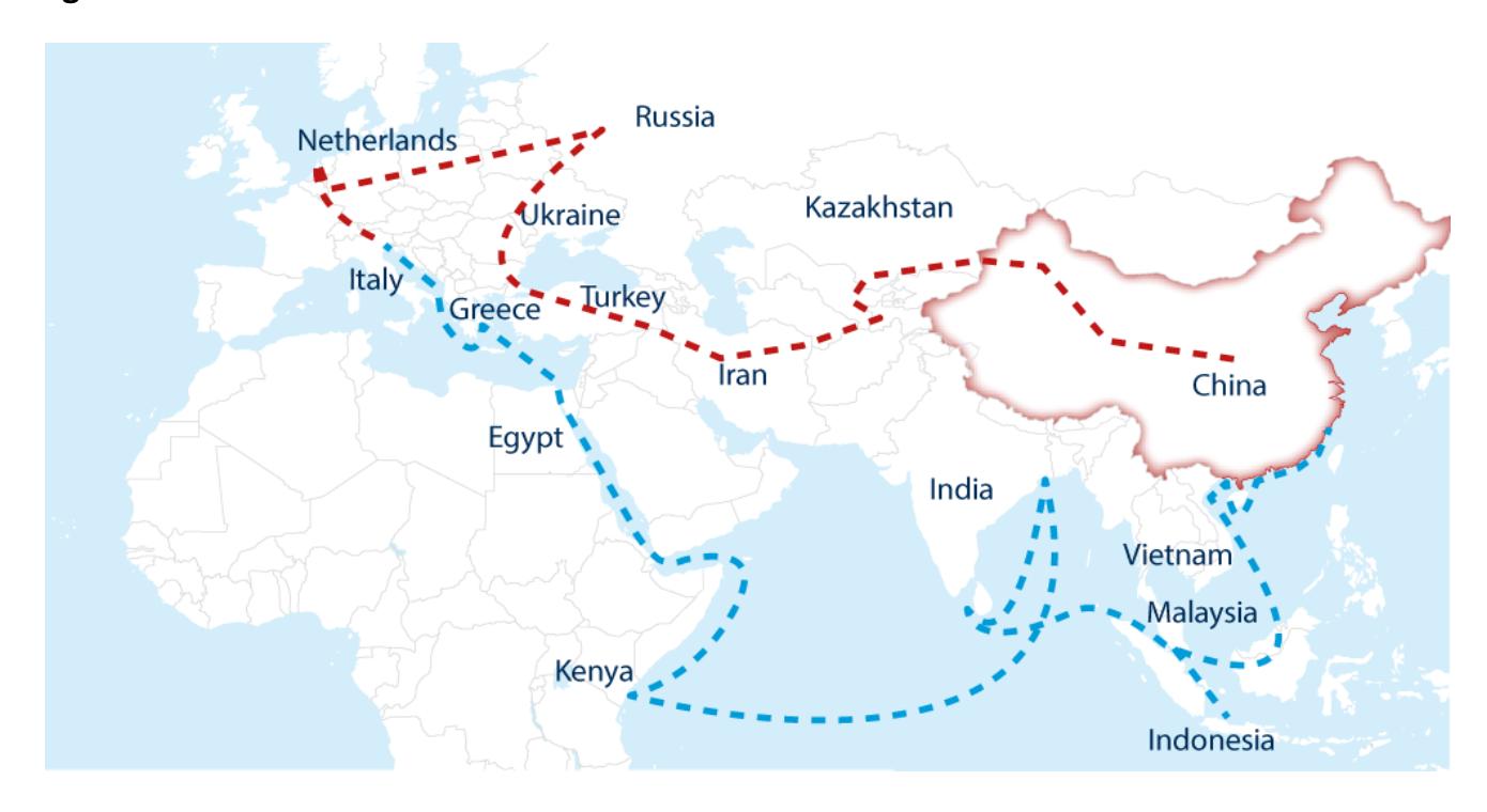
Figure 2. The land and maritime routes of 'the Belt and Road'